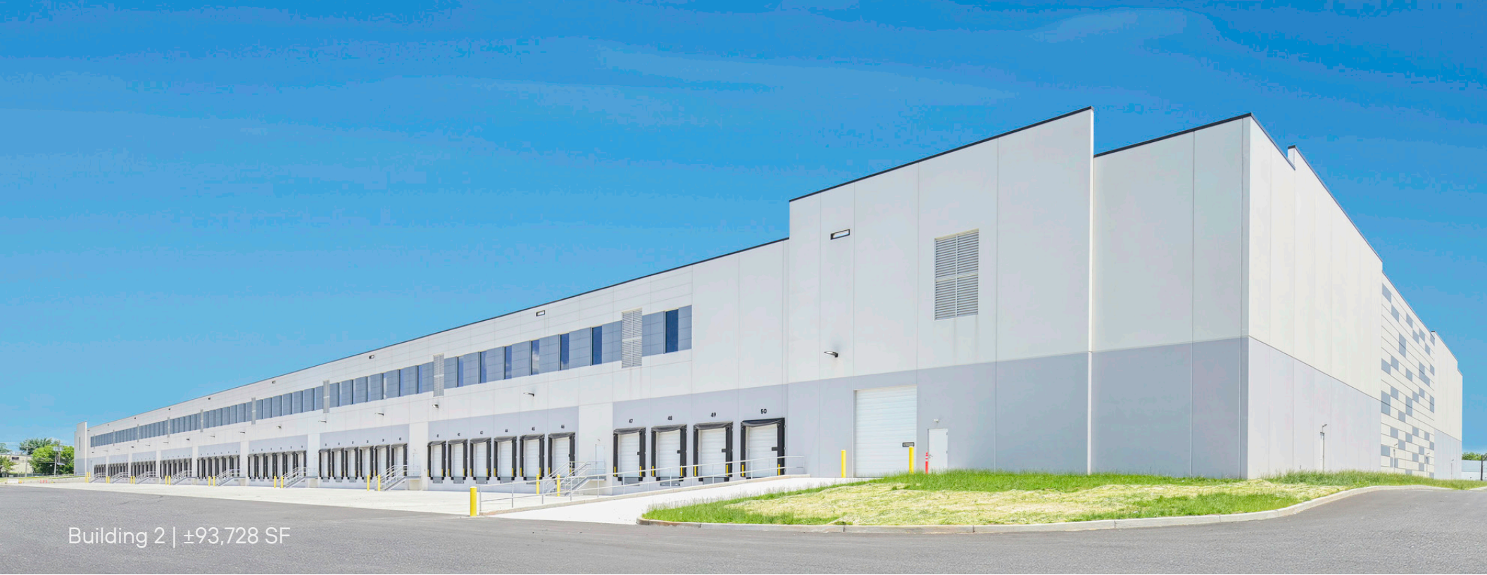
Building 2 | ±93,728 SF